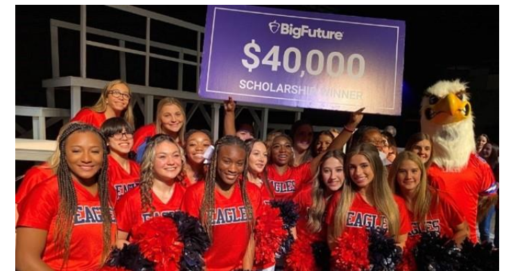
August 2022: Carrington from Texas